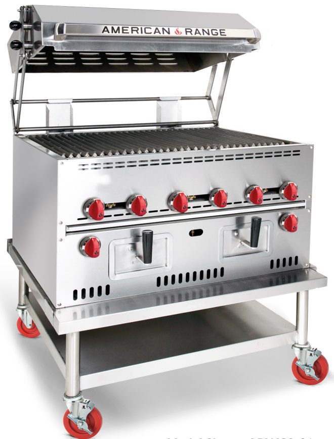
Model Shown ARWCS-36